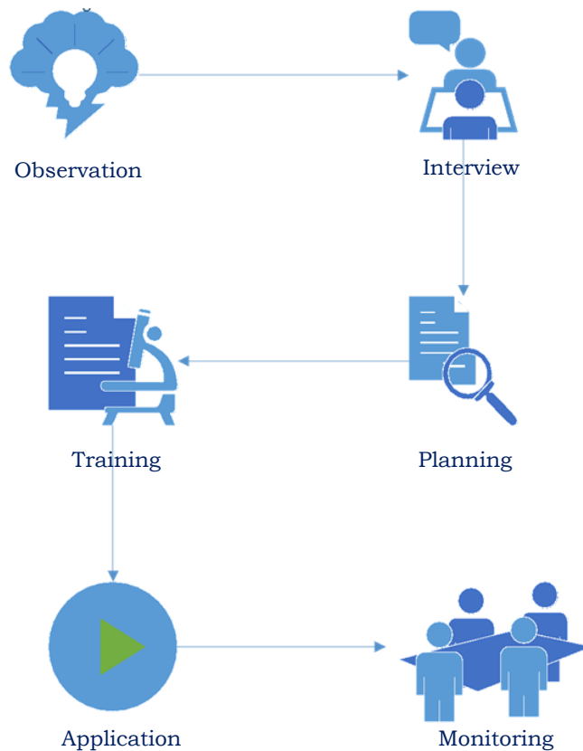
Figure 1. Process of implementing activities.

monitoring, as shown in the flowchart in Figure 1. The first process begins with observation, where at this stage, observations are made regarding the obstacles and problems faced by SME Hippocrates Medika. The data collected is consumer testimonials of freedia herbs, especially in terms of taste and practicality of freedia herbs. Furthermore, a direct interview process was carried out with SME Hippocrates Medika to find out the partner's opinion about the preparation of freedia herbs.